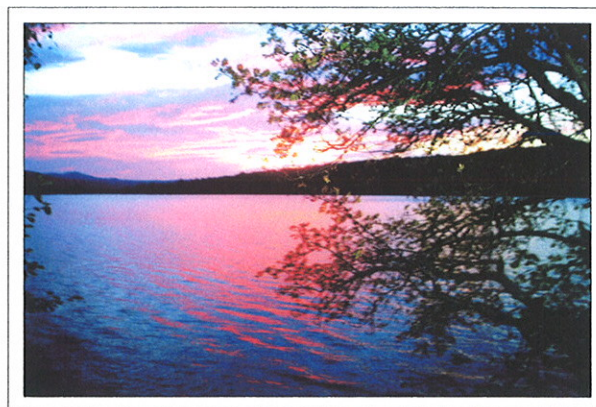
LOCH ACHILTY, CONTIN

As to the future, we would pray that our expanded parish flourishes . We would also wish to see the congregation attract the younger generation. As a church we consider it our distinct call and duty to make God's love known to the people.