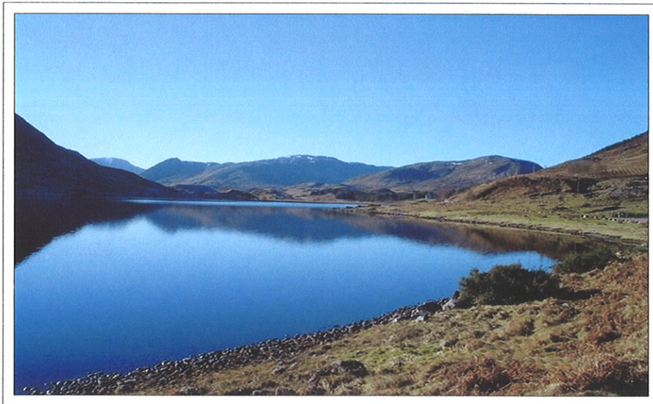
LOCH BEINNACHARAIN, SCARDROY, STRATHCONON

The population of the parish is around 1,500, the majority of whom would claim allegiance to the Church of Scotland. Members and adherents number 92. Other denominations include Free Church, Free Presbyterian, Roman Catholic, Episcopalian and Jehovah's Witnesses.